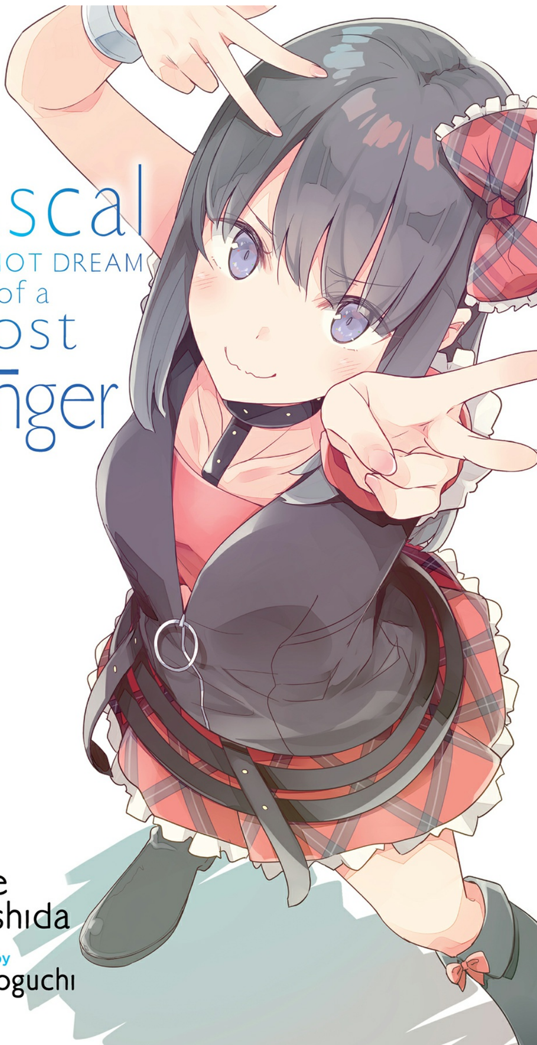
Illustration by KEJI MIZOGUCHI