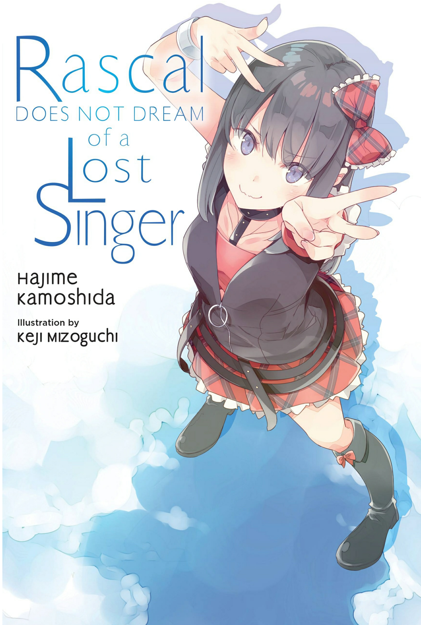
Illustration by KEJI MIZOGUCHI